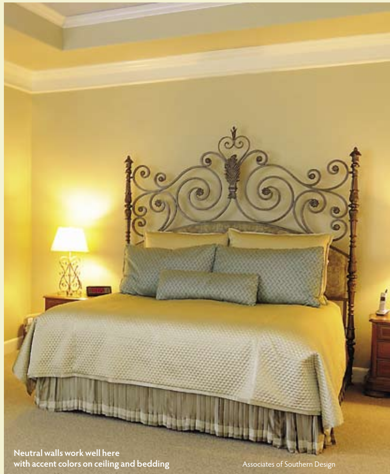
Neutral walls work well here with accent colors on ceiling and bedding

Just as pieces of jewelry, belts, and bags can change the look of an outfit, home accessories can transform the look of a room. Sugar Land’s diverse population inspires many to include international flavor to their decorating style, mixing decorative items from