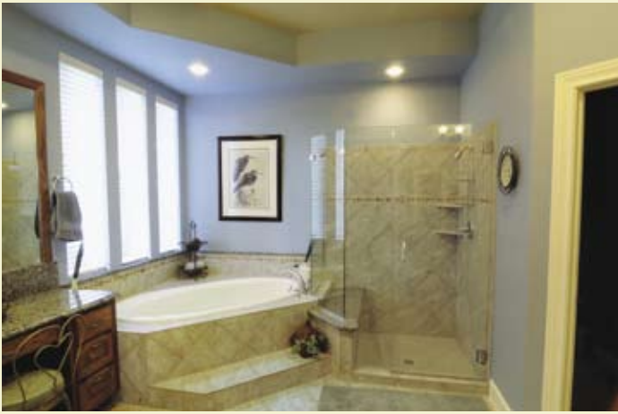
Simply the right color on walls and art work really brought together this master bath designed by Associates of Southern Design