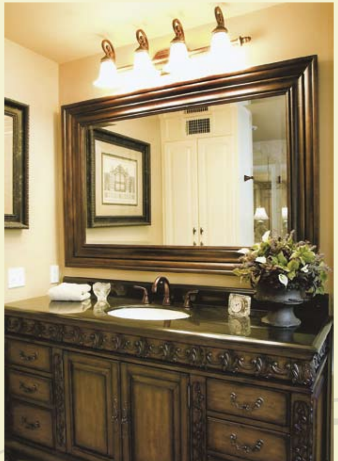
Updated cabinetry and lighting by Design Source