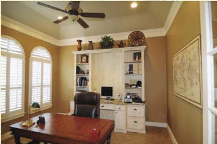
This office in Greatwood updated by Associates of Southern Design once again uses paint and a custom built work station that hides computer wires yet makes them easily accessible

Although updating with faux is in, using wallpaper borders is definitely out. “No, make that go away,” laughs Wagisbach. Weathered agrees, “Unless it’s a little child’s room, where you can get really fun.”