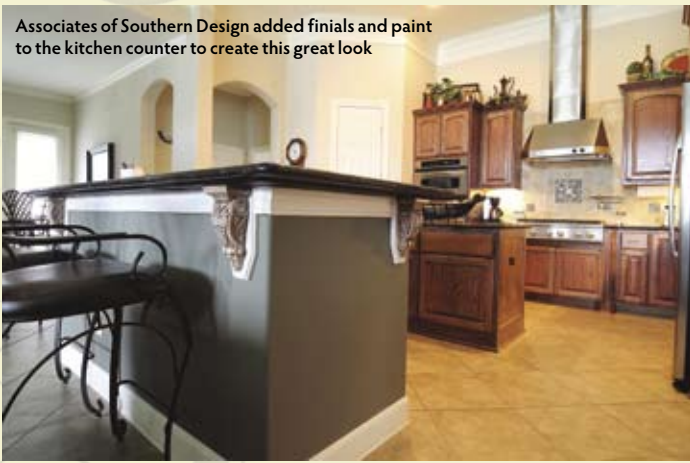
Associates of Southern Design added finials and paint to the kitchen counter to create this great look