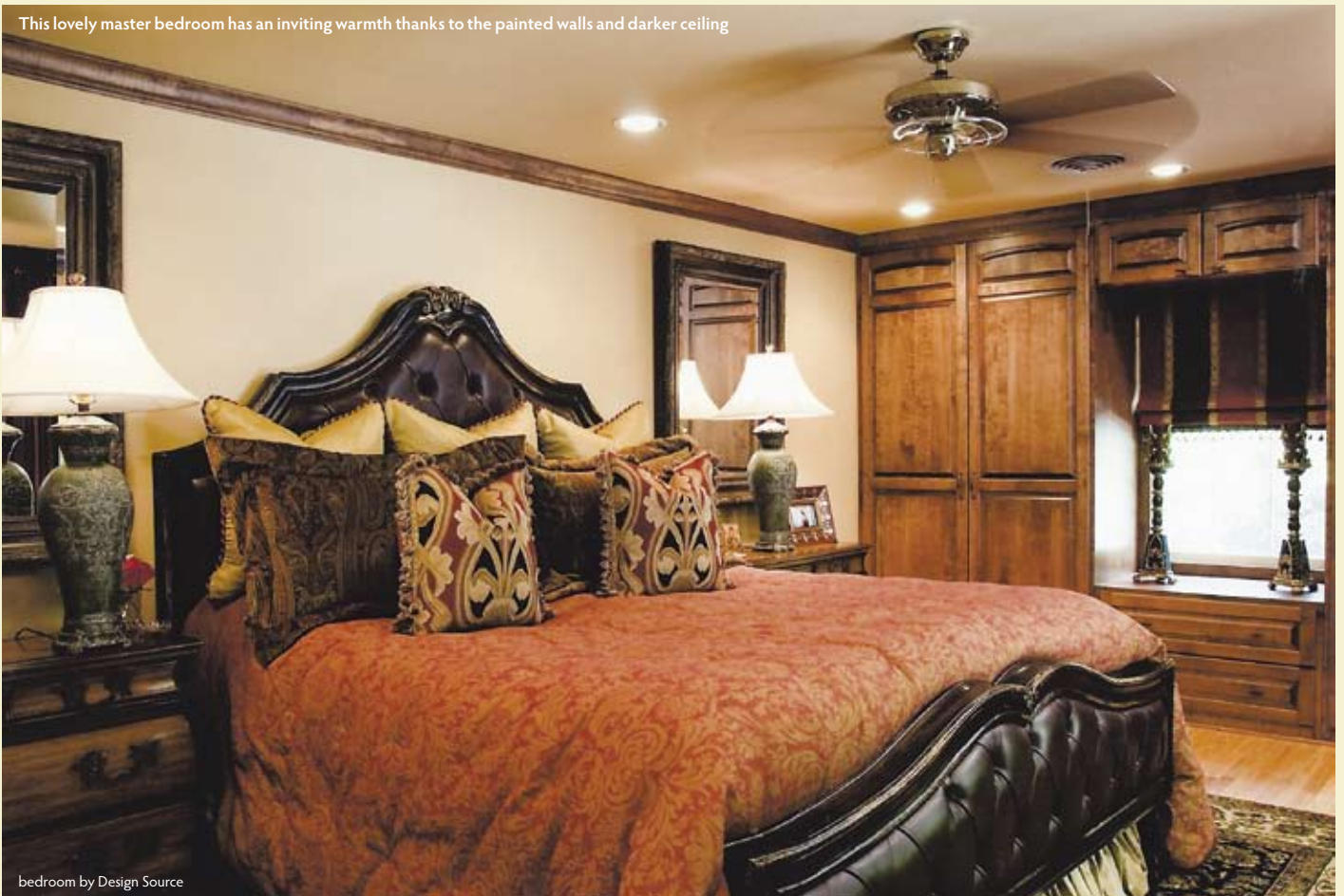
This lovely master bedroom has an inviting warmth thanks to the painted walls and darker ceiling